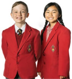
Junior School and Nursery Co-educational 3 to 11 years