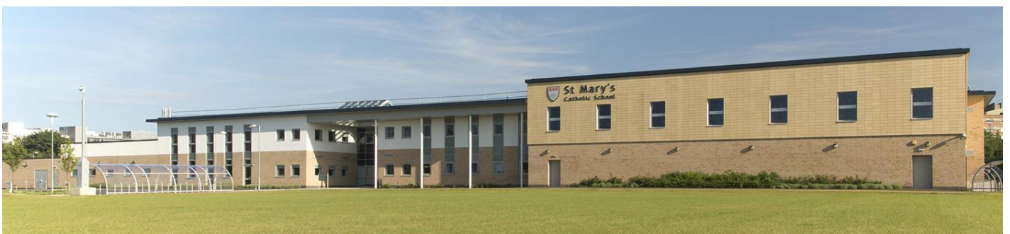
The new school – front elevation